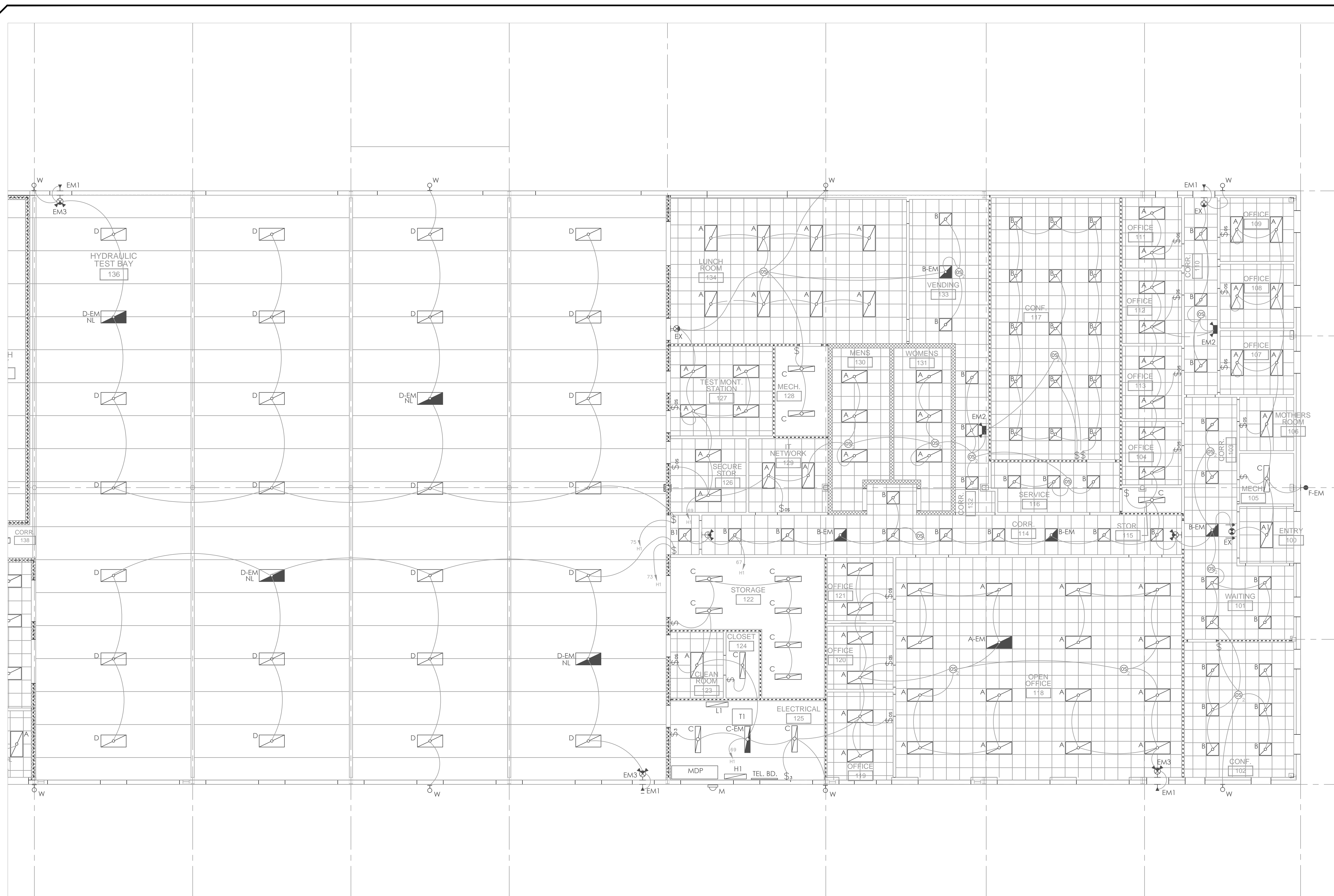
ENLARGED FLOOR PLAN SCALE: 1/8" = 1'